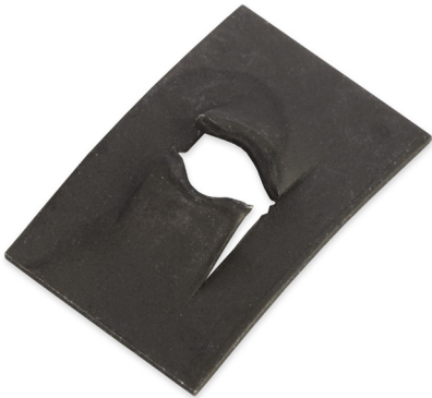
0: Round (Sides Cut Off)